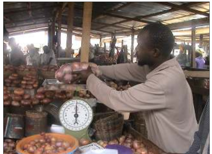
A trader in Agboghloshie Market weighing his product on one of the scales supplied by MISTOWA for the pilot project.

In Nigeria, the Lagos Mile 12 Market Association is also promoting the use of weighing scales for the sale of grains and legumes.